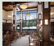
TETON SPRINGS RESORT